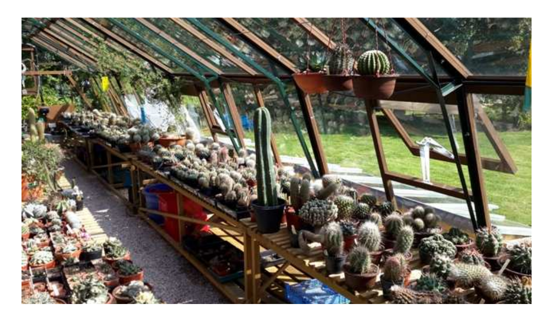
Page 10 of 10