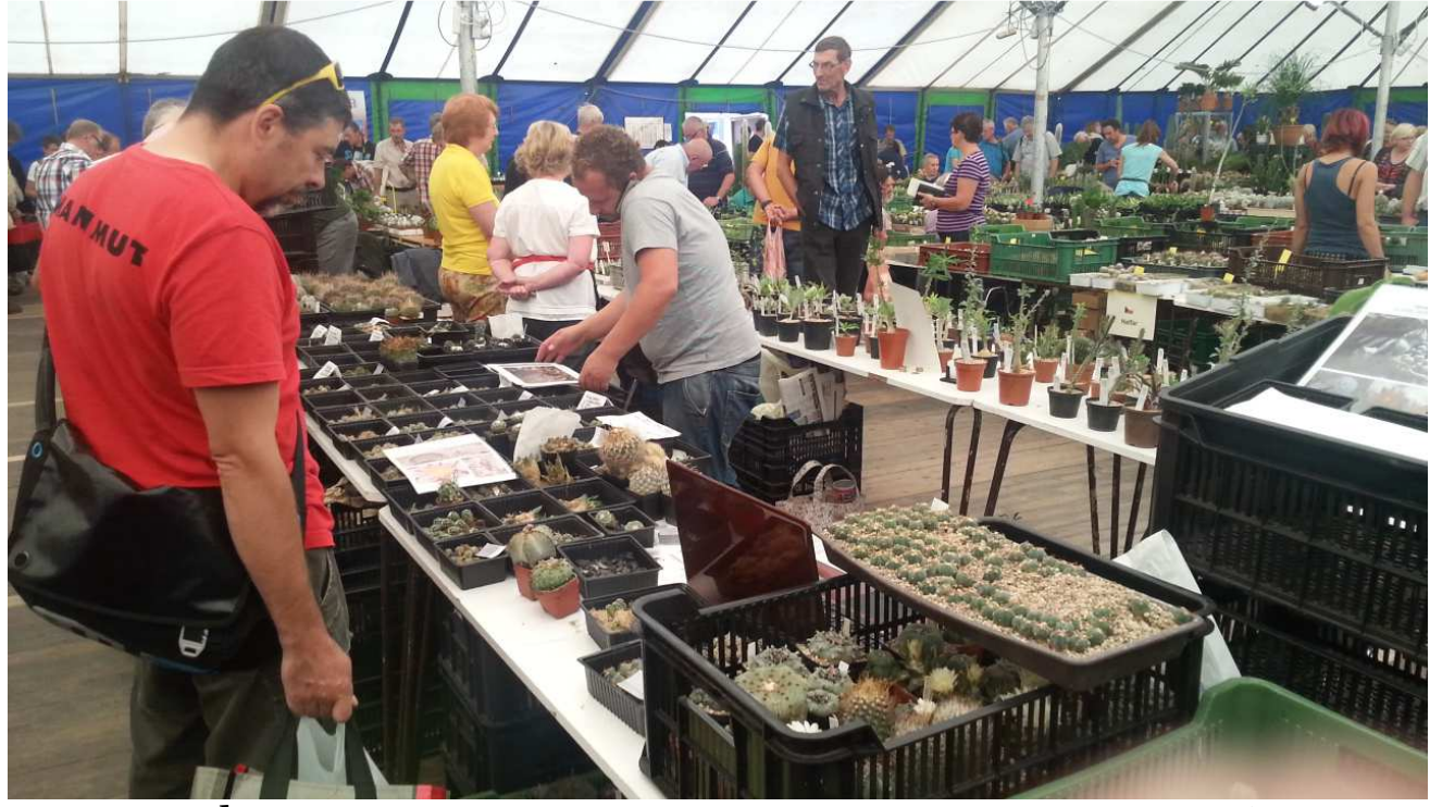
ELK 2014, The Marquee