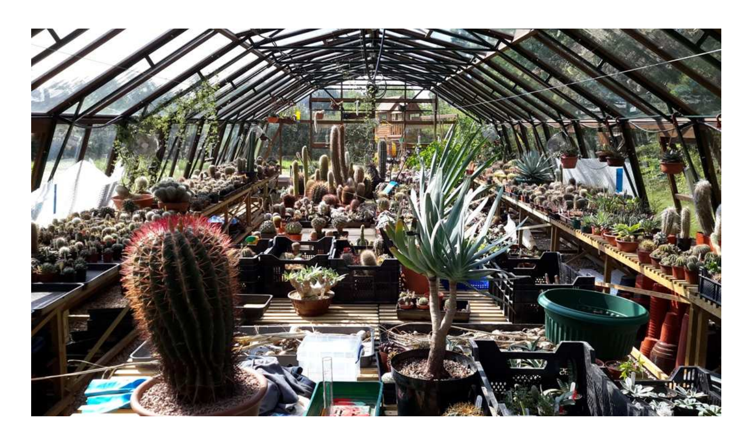
Page 9 of 10